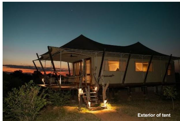
Exterior of tent

Delicious meals are served in the main communal area of the lodge and your stay includes breakfast, lunch, afternoon cake and a three-course dinner, as well as a selection of soft and alcoholic drinks (excluding premium brands). All game drives and walking safaris are also included.