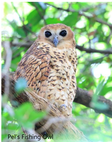
Pel's Fishing Owl

Patience and timing are the key to successful wildlife photography, coupled with the ability to react when the moment arrives! We plan to spend less time traversing large distances and more time observing, gaining quality time with a range of subjects in differing lighting and scenic settings. Each day begins with an early wake-up call, before we head out to spend the entire morning in the field, maximising photographic opportunities as they present themselves. Once the heat of the day starts to kick in we will return to the lodge for brunch, after which you are free to relax, or enjoy some birdwatching or game-viewing from the camp which is set near the banks of the Luangwa River.