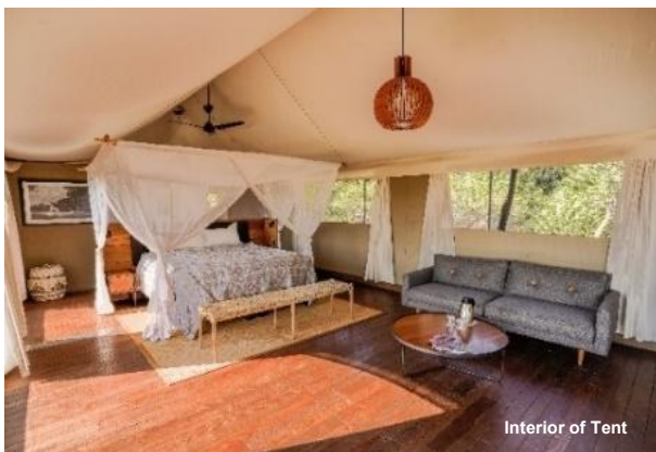
Interior of Tent

This safari includes all meals and accommodation, with the exception of any meals necessary in Lusaka. We will be based at Chikunto Safari Lodge, a stylish hybrid lodge/bush-camp that holds a maximum of 12 guests in five very comfortable and spacious tents situated on raised wooden platforms (see https://www.chikunto.com/ ). Each tent has an ensuite bathroom, wardrobe and both an indoor and outdoor seating area. One of the tents is connected by a wooden boardwalk to a raised stargazing platform out on which guests can sleep for the night under the stars (subject to availability and may incur a supplementary cost).