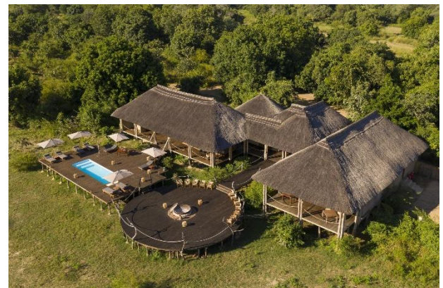
Images from top: Leopard, White-fronted Bee-eater, Chikunto Safari Lodge