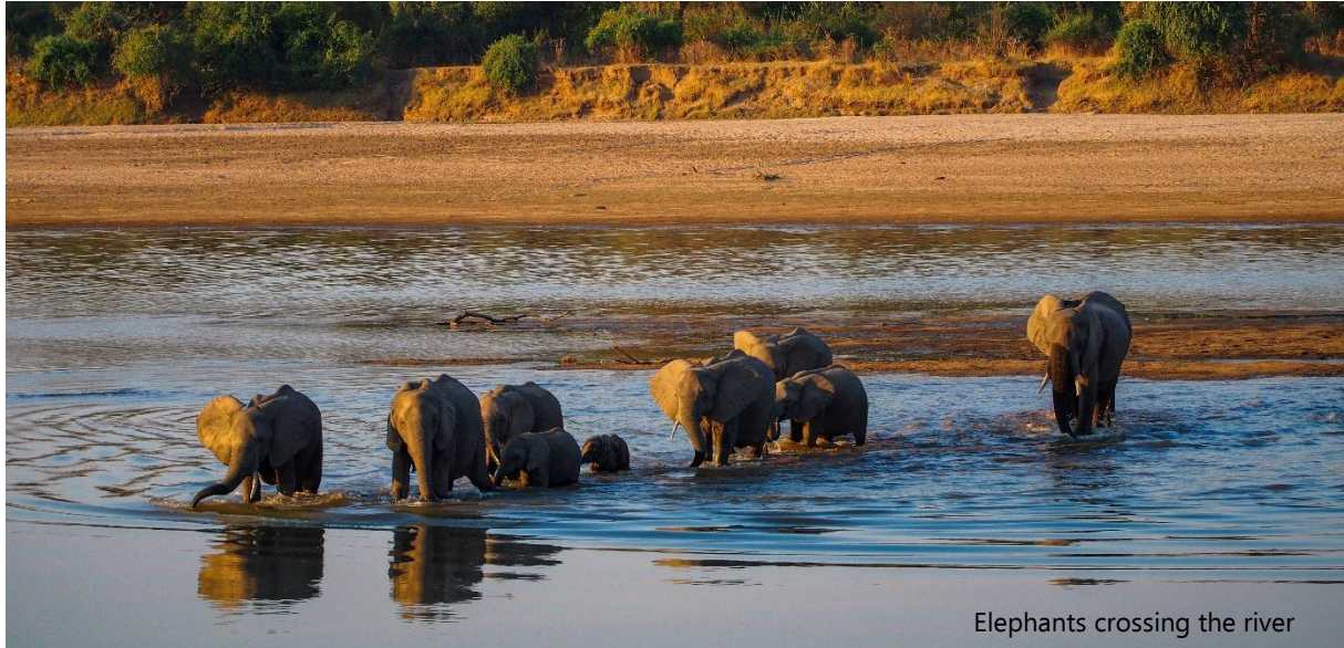
Elephants crossing the river

This morning we will enjoy our first full safari drive before returning to our lodge for brunch. We will have time to review this morning's images and perhaps spend a little time photographing on foot around the lodge grounds or using the hide by the waterhole.