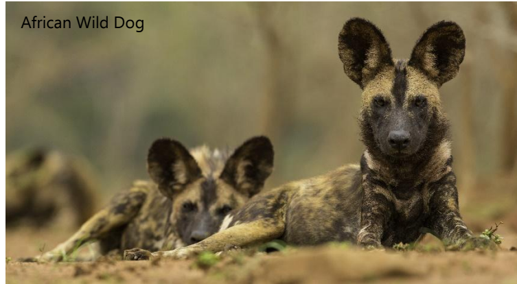
African Wild Dog

During our stay we will be presented with a wide range of conditions in which to shoot, and we will take our time each day. Our photographer-leader will be on hand to coach and advise as much as needed, whilst at the same time putting photographers into situations where they can challenge themselves and be encouraged to “see” a different image to the standard one. We will work on making decisions in-viewfinder, at speed and without spending too much time looking at the back of the camera. Whilst we can’t promise what we will find and what it will be doing, we will certainly make the most of any situation that presents itself! From context-shots, to intimate portraits to motion-blur and freezing action, we’ll be looking to test our full repertoire over the course of the trip. We will also find time to review the images taken each evening for those that wish to do so.